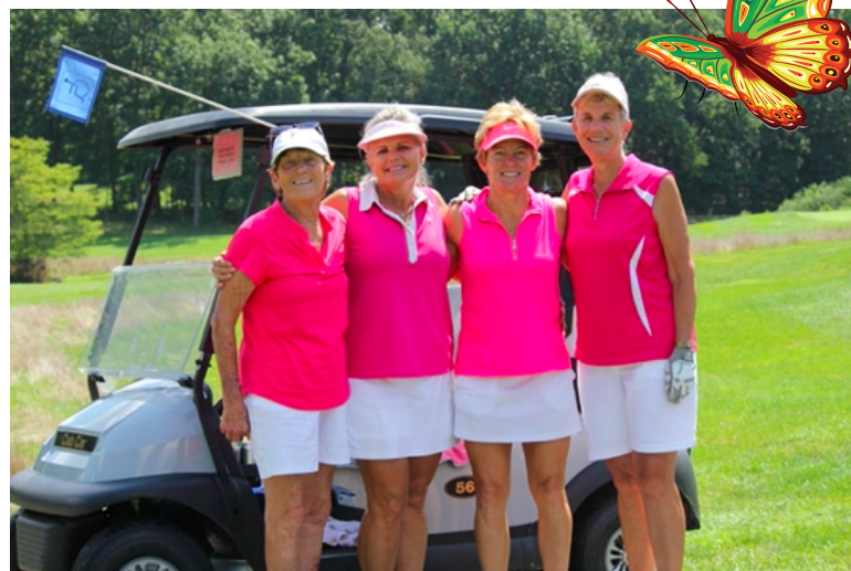
This years winning team!