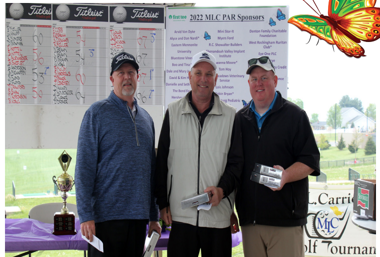
This years winning team!