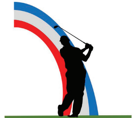
Fairways for Heroes

Our program provides free golf instruction, equipment and access to our learning facilities/program locations, as well as plenty of great fellowship. We would like to also say thank you to the professional golfers from around the Shenandoah Valley that have pledged their time to help grow and develop this program. This year we are excited to announce that McDaniel Contractor Services has partnered with us to help grow this program throughout the entire Shenandoah Valley!